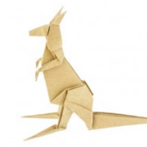
Oceania acquisition for Japan Pulp and Paper