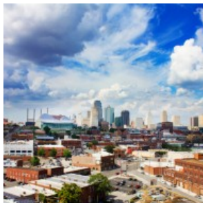
Office Products Alliance President talks future-proofing