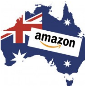
Prepare now for Amazon Australia arrival