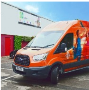
Commercial Group to expand after strong 2016