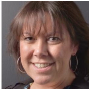
VOW appoints Furniture Category Director