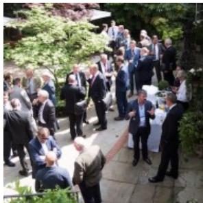
BOSS Members' Day speakers announced